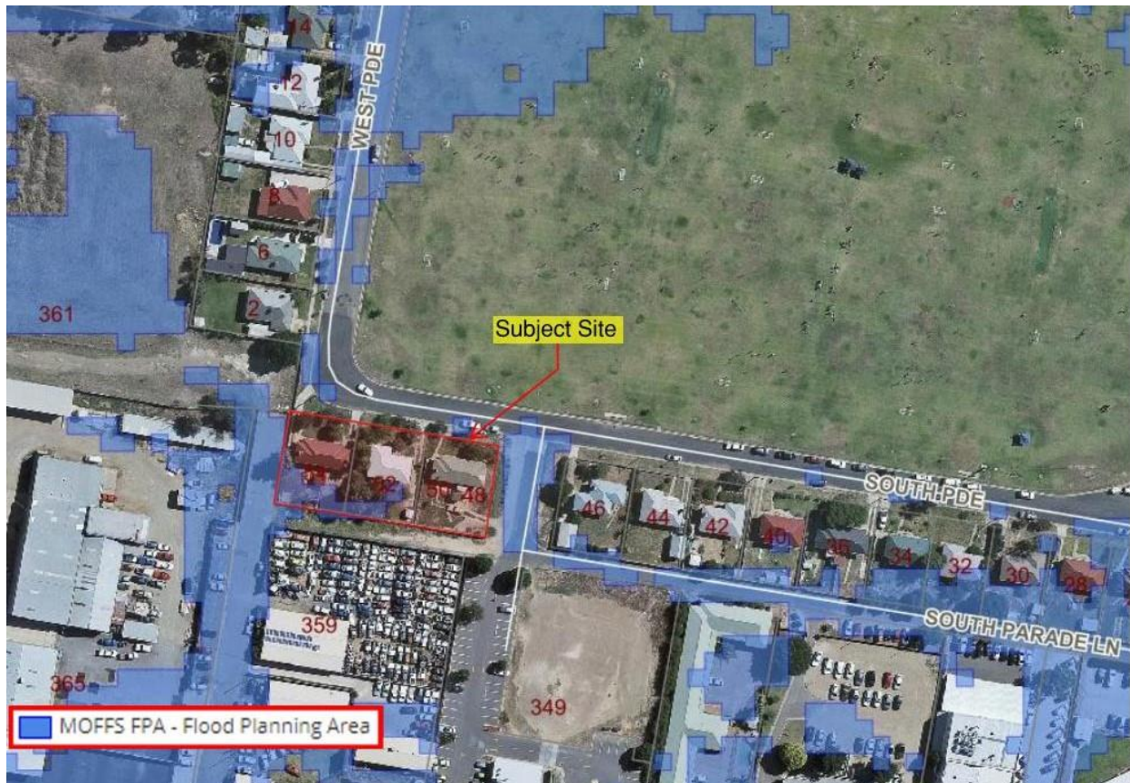
Figure 1-2 Wagga Wagga MOFFS Flood Planning Area

The purpose of this report is to summarise the mitigation measures that have been considered for this development to manage the impact of the flooding and ensure the safety of the occupants of the proposed development in accordance with Clause 5.21 of the Wagga Wagga Local Environmental Plan 2010 (LEP).