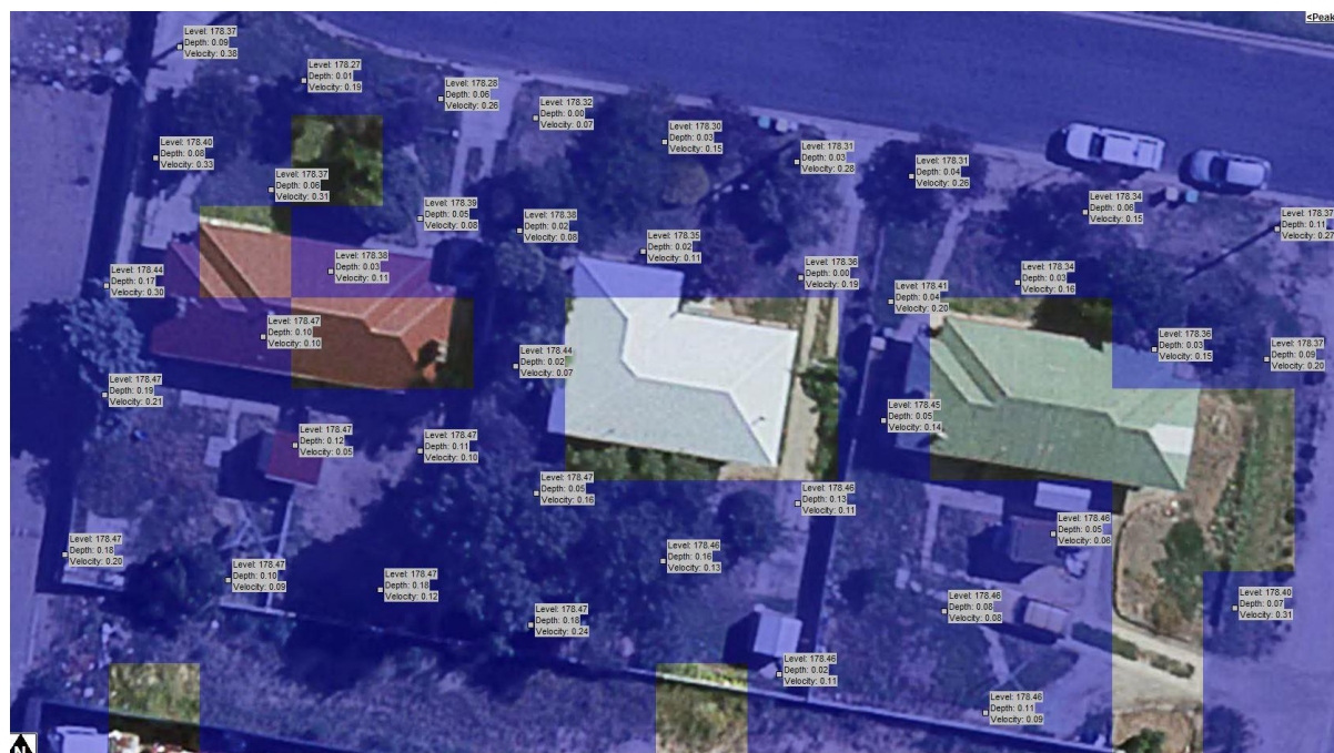
Figure 2-1 Overland Flow Levels, Depths, and Velocities

From flooding information supplied by WWCC, as shown in Figure 2-1 , the maximum MOFFS level within the site is AHD 178.47, and from the design, the OSD storage's maximum design water surface level is 178.62, therefore, the proposed development has been designed to have an FFL of AHD 178.92. This ensures that the properties and the occupants will not become inundated during the 1% AEP event, allowing them to safely wait in the buildings until the waters recede. Additionally, the 300mm freeboard ensures adequate room for any increases in the 1% AEP level due to climate change or other climate-related events.