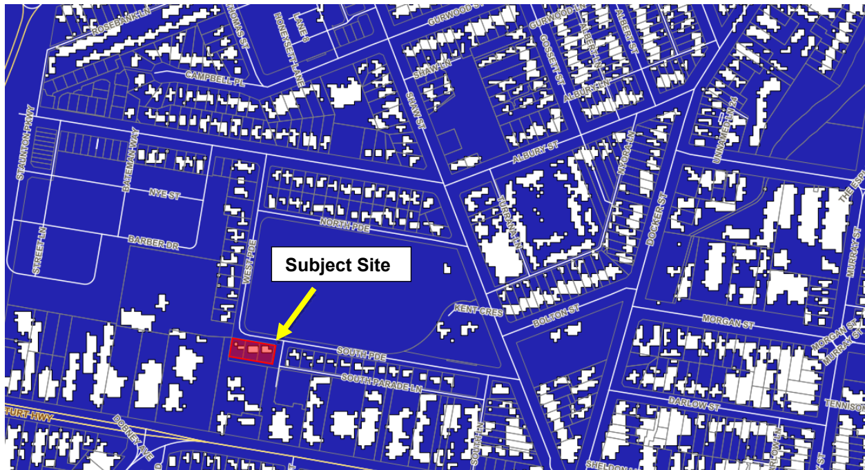
Figure 3-2 MOFFS PMF