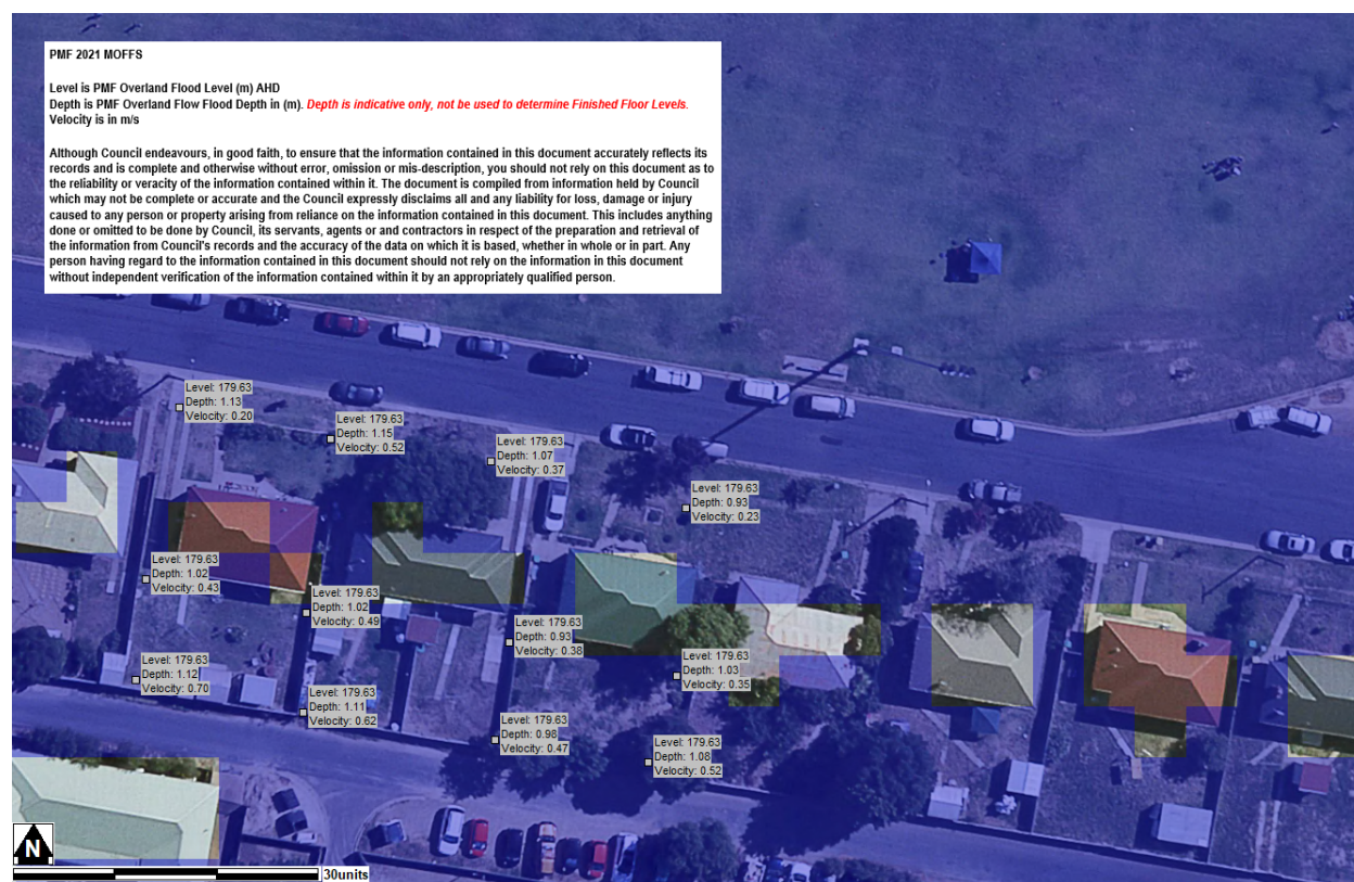
Figure 3-1 MOFFS PMF data

As can be seen, the average depth across the site is 1.31m while the average velocity is 0.41m/s. this means that the site will have a Hazard Level of H4, which is considered unsafe for vehicles and people.