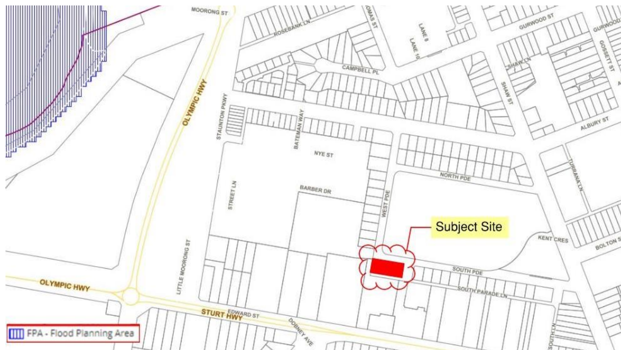
Figure 1-1 Wagga Wagga Riverina Flood Planning Area

As part of the proposed development upon 48-56 South Parade, Wagga Wagga, an investigation was undertaken into the impact of flooding on the subject site. Using flood mapping information supplied by Wagga Wagga City Council (WWCC), the subject site is not expected to experience riverine flooding during a 1% AEP Flood Event and therefore is not within the WWCC Riverine Flood Planning Area (FPA). Refer to Figure 1-1 . The site is, however, affected by the 1% AEP and is within the Major Overland Flow Flood Study (MOFFS 2021) FPA. Refer to Figure 1-2 .