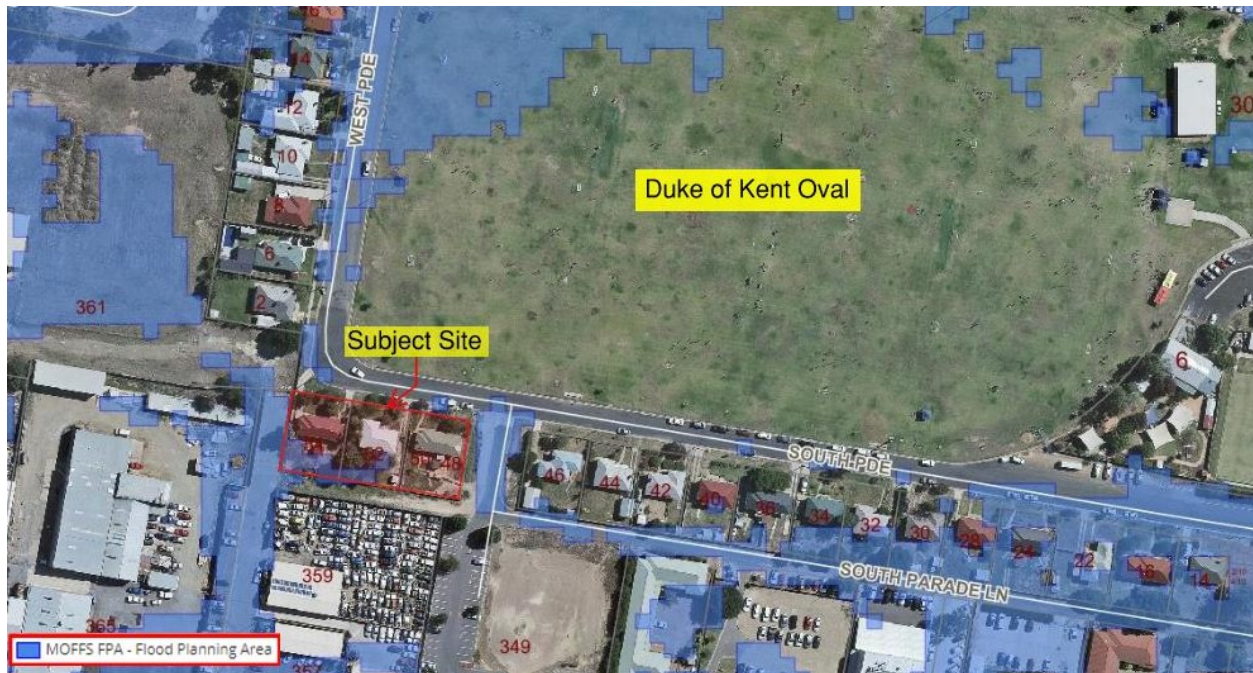
Figure 2-2 Evacuation Area